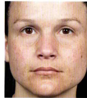
BEFORE CLEAR + BRILLIANT ORIGINAL