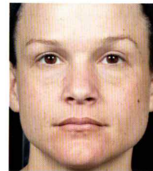
1 MONTH POST 6 TREATMENTS